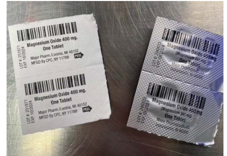
Figure 1. Magnesium Oxide 400 mg tablets by Major Rugby with paper-backed foil (left) and the difficult-to-scan reflective foil backing (right).

(Major Rugby). Poor barcode readability when black ink is printed on reflective foil backing ( Figure 1 ) is a long-standing issue. Several health systems reported a decrease in barcode scanning compliance from nearly 100% down to as low as 40%. One organization shared a downloadable list of the National Drug Codes (NDCs) on products that may be impacted ( www.ismp.org/ext/1200 ).