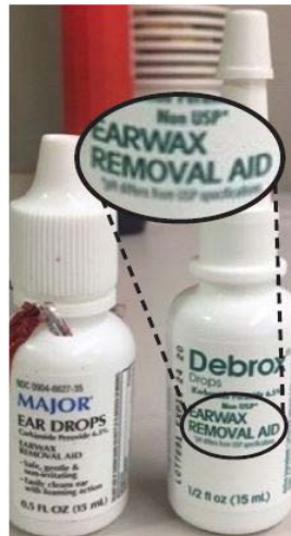
Figure 1. Carbamide peroxide 6.5% ear drops by Major Pharmaceuticals (left) is packaged in a dropper bottle similar in size and shape to an eye drop container. DEBROX by Prestige Consumer Healthcare has a long neck for otic administration and the label states “EARWAX REMOVAL AID” in large font (right).

To reduce the risk of administering ear drops into the eyes, consider the recommendations listed in the Check it Out! column to the right.