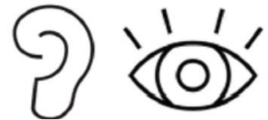
Figure 3. Examples of standard graphics that manufacturers can use on cartons and container labels to visually portray use in the ear (left) or the eye (right).