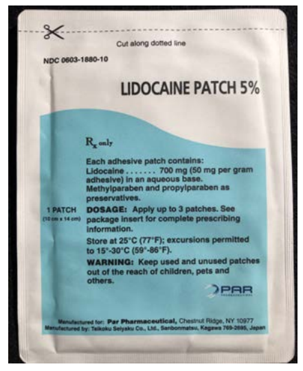
Figure 1. Example of a lidocaine patch with "DOSAGE" instructions that state "Apply up to 3 patches. See package insert for complete prescribing information."

No, not three lidocaine patches at a time! A prescriber ordered a lidocaine 5% patch for an elderly patient with instructions to "apply 1 patch daily, for 12 hours on and then remove for 12 hours." However, the patient applied three patches daily instead. Rather than following the instructions on the prescription label, the patient followed the "usual dosage" information on the outer package, which states "Apply up to 3 patches. See package insert for complete prescribing information." While the manufacturer was not reported, there are several lidocaine patch products