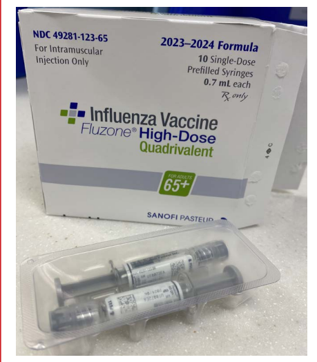
Figure 1. Fluzone (high-dose) comes with two singledose syringes sealed in each tray.

Confusing Fluzone high-dose pack aging leads to error. Last month, we received a report about a concern with this year's FLUZONE (influenza) high-dose quadrivalent vaccine. The product is manufactured by Sanofi Pasteur and is packaged in cartons that contain 10 single-dose prefilled syringes. However, within the carton are five sealed trays, each containing two 0.7 mL single-dose syringes ( Figure 1 ). The concern is that some may think both syringes are needed to administer a dose, especially since it is referred to as a "high dose" influenza vaccine (intended for people 65 years and older).