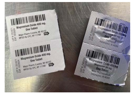
Figure 1. Magnesium Oxide 400 mg tablets by Major Rugby with paper-backed foil (left) and the difficult-to-scan reflective foil backing (right).

(Major Rugby). Poor barcode readability when black ink is printed on reflective foil backing ( Figure 1 ) is a long-standing issue. Several health systems reported a decrease in barcode scanning compliance from nearly 100% down to as low as 40%. One organization shared a downloadable list of the National Drug Codes (NDCs) on products that may be impacted (www.ismp.org/ext/1200).